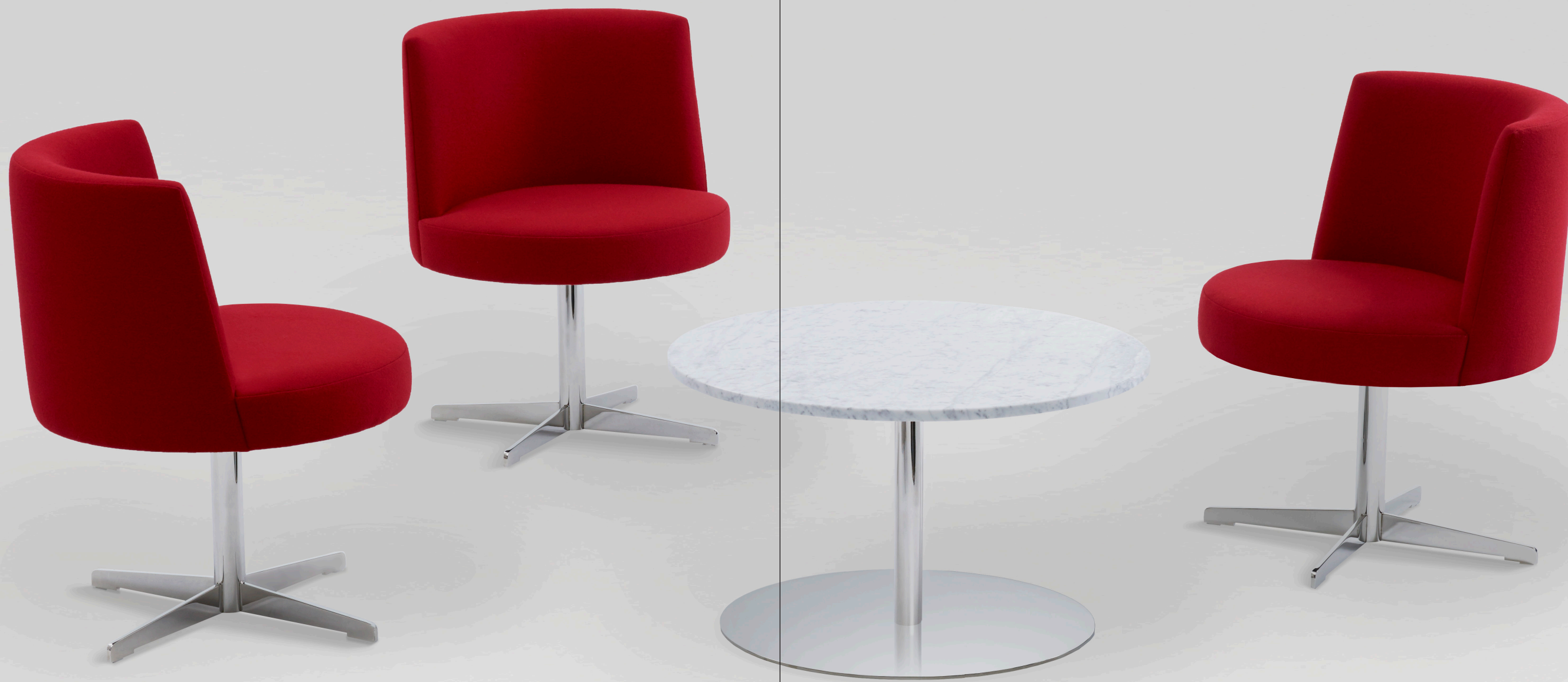
Above STYLE 1025-01 Chair, Swivel Base STYLE 982-30 C Reveal, Coffee Table